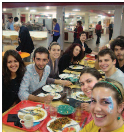
Pollock Halls Cafeteria