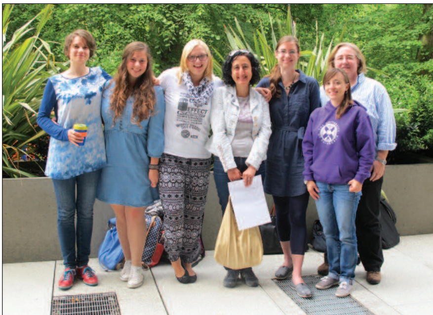
Students in George Square