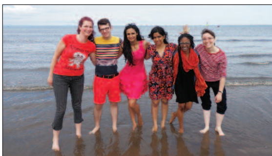
Students at Portobello Beach

During six weeks of the summer, SUISS offers two programmes of study: Text and Context and Creative Writing . Students may choose to attend a continuous programme of study or to attend a combination of courses. The academic sessions are held at George Square, The University of Edinburgh, where the students also have access to all library and computing facilities.