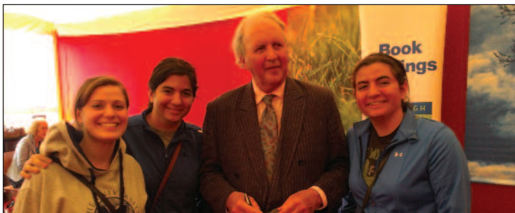
Students with Alexander McCall Smith