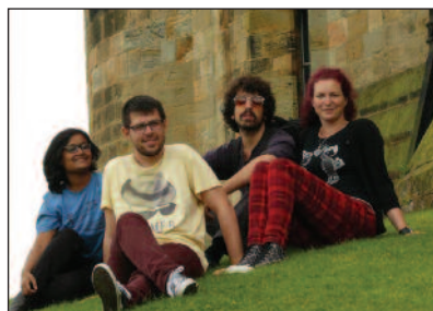
Students at Alnwick Castle