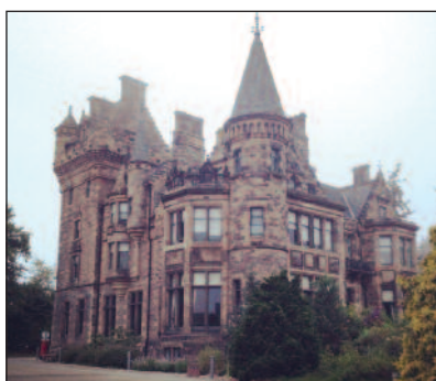
Pollock Halls of Residence

"Overwhelming, astonishing and widening my mind in the most incredible way - it still feels like a dream." Melanie, Germany