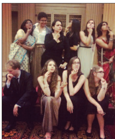
SUISS Annual Reception