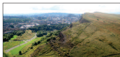
View Over Salisbury Crags