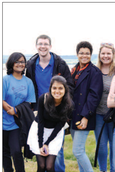
Students at St Andrews